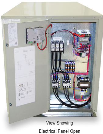
View Showing Electrical Panel Open

STANDARD ON ALL LEGACY CHILLER MODELS: Pentra Microsmart, Programmable Logic Controller (PLC) with HMI Touch Screen Display.