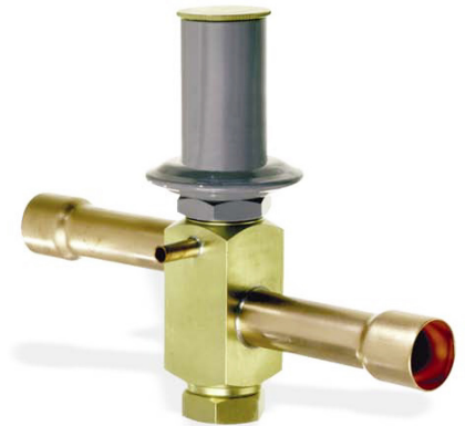
Hot Gas By-Pass Valve