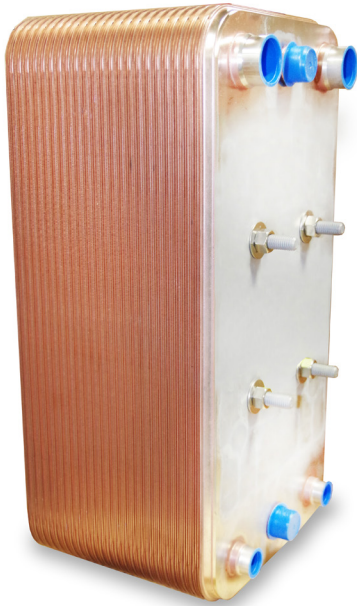
Brazed Plate Heat Exchanger/Evaporator (Dual Circuit)