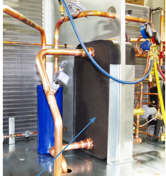
Installed Brazed Plate Heat Exchanger/Evaporator with insulation covering

Brazed Plate Heat Exchangers/Evaporators are stainless steel brazed at all contact points, ensuring optimal heat transfer efficiency and pressure resistance. The plates are designed to achieve longest possible lifetimes. Since virtually all material is used for heat transfer, the Brazed Plate Heat Exchanger is very compact in size and has a low weight. The brazed plate heat exchangers ensure the customer the most cost-efficient solution for the process heat transfer duties.